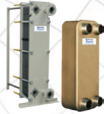
Plate & Frame and Brazed Plate Heat Exchangers