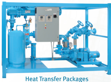
Thrush/WILO Pumps and Circulators