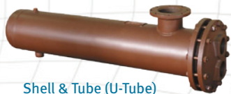
Shell & Tube (U-Tube) Heat Exchangers